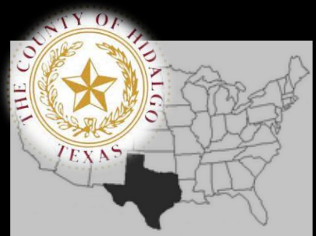
US Army Corps of Engineers Land Acquisition