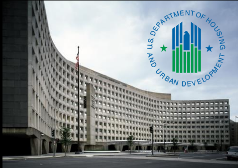
HUD Capital Plan FY24-28