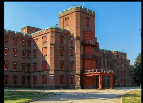
St. Elizabeths East Campus