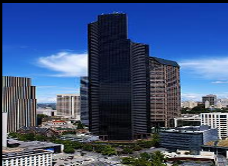
US Health & Human Services Seattle Office