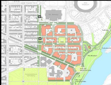
Hill East – Capitol Hill