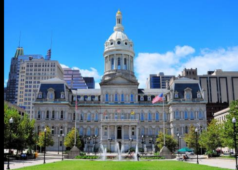
City of Baltimore Future of Work Pilot