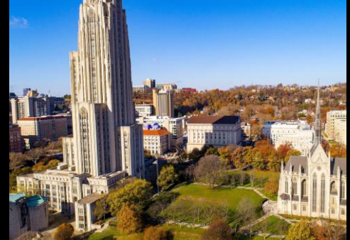
University of Pittsburgh